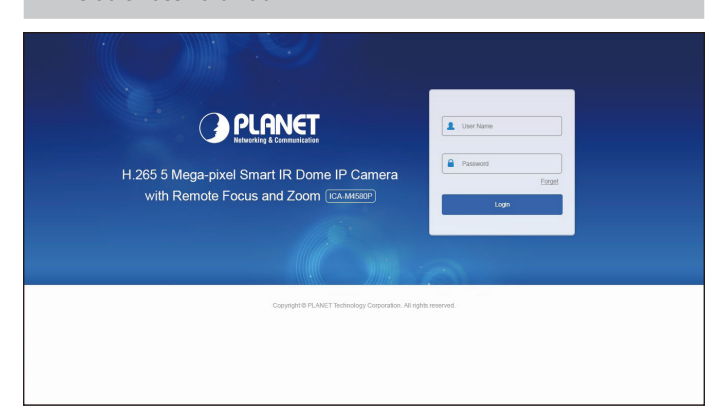
Figure 4-3: ICA-x80 series Web Login Screen

Default Username: admin Default Password: admin